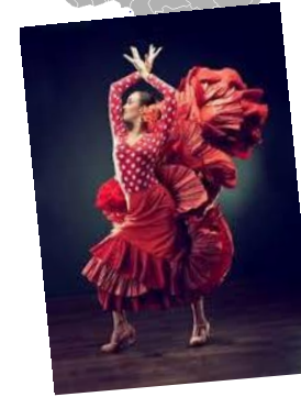
Learn about different art forms from the Spanish-speaking world

The Importance of Spanish: Spanish is the fourth most spoken language in the world second most spoken in the United States. By 2050, the USA will likely be the nation with the most Spanish speakers.