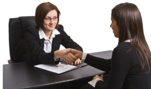
Learn to write a cover letter and prepare for a job interview in Spanish