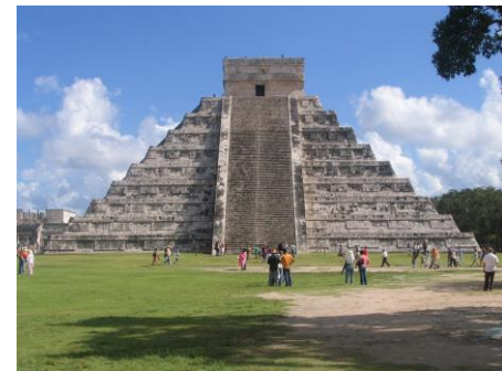
Learn to describe myths and legends from Spanish-speaking countries and pre-Hispanic civilizations